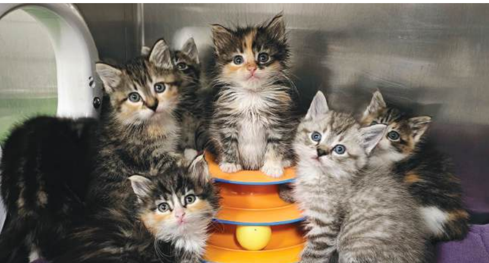
A stray litter prepares for their first step, fostering on the way to adoption.