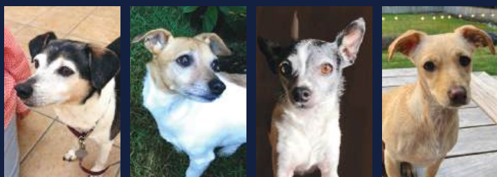
COOPER ADOPTED 07/2001