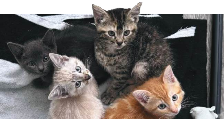
Kittens waiting for be adopted!